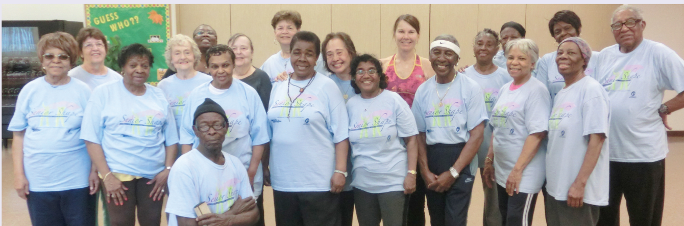
20722 | Seniors across Montgomery and Prince George's counties are able to improve their cardiovascular health while keeping their bodies and minds in shape. More than 12,500 residents of Prince George's, Calvert and St. Mary's counties have participated in free cardiovascular health initiatives provided by the NIH Heart Center at Suburban Hospital.