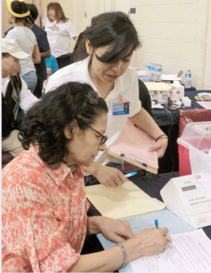
20877 | In partnership with the Montgomery County Latino Health Initiative, Suburban Hospital conducts free blood pressure and cholesterol screenings to residents at the annual Ama Tu Vida/Love Your Life multicultural festival.