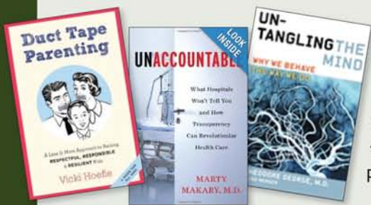
20814 | Community members have the opportunity to attend free seminars featuring health experts on a range of topics, from parenting techniques to understanding our behaviors.