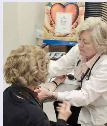
20815 | The nurse is in! Active senior community members visit several of the HeartWell clinic locations to get professional guidance on medication management and key markers of heart health.