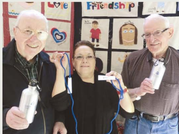
20877 | Taking laps around Lakeforest Mall for years, community members have developed lifelong friendships while having their blood pressure checked and improving their overall physical, emotional, and mental wellbeing.