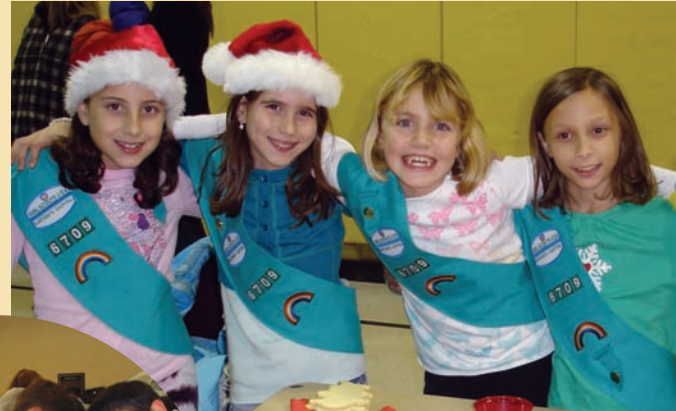
The gift of giving! This local troop from Burning Tree ES offers a Friday evening to assist Suburban Hospital with a community partnership event at the Scotland Community Center.