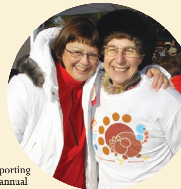
Supporting the annual YMCA/BCC Rotary Turkey Chase benefits local parenting and youth programs.

G.O.S.P.E.L. | Housing Opportunity Commission | Latino Health Initiative | Montgomery County Cancer Crusade | Montgomery Housing Partnership, Inc.