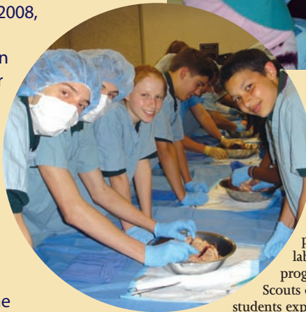
Members of the Suburban Hospital Medical Venturing Crew #1984 participate in a hands-on cardiovascular lab. Medical Venturing is an educational program in partnership with the Boy Scouts of America designed for high school students exploring various careers in medicine.

SOME OF OUR PARTNERS | American Trauma Society | Boy Scouts of America | Hadassah, Greater Washington Area Chapter | Maryland Hospital Association | Montgomery County Department of Parks and Recreation | Montgomery County Public Schools | Safe Kids Coalition | Safe Sitter International | YMCA Youth and Family Services | Scotland Community