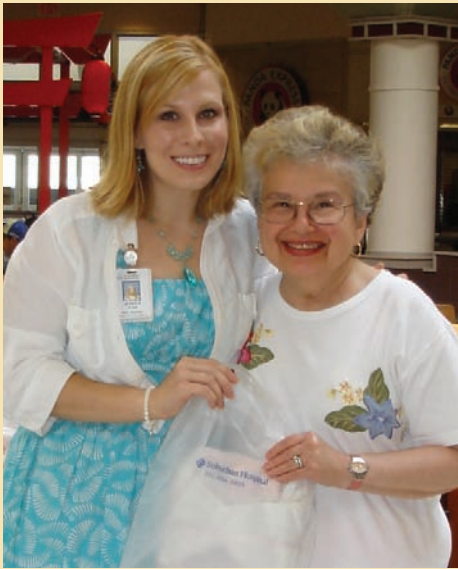
For more than 20 years Suburban Hospital has partnered with Westfield Montgomery Mall to provide blood pressure screenings and educational programs to Stepping Out mall walker participants. Keep your heart strong; join us Tuesdays and Thursdays from 7:30 to 9:30 a.m.

Suburban Hospital engages the area's growing senior population by encouraging active, healthy lifestyles through programs designed to help older adults gain optimum health.