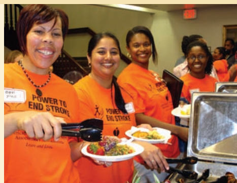
G.O.S.P.E.L. participants learn the recipe for a healthy heart. Partners at the Center for Health Disparities at the Uniformed Services University of the Health Sciences provide valuable technical support for G.O.S.P.E.L.'s Heart Health Symposium.