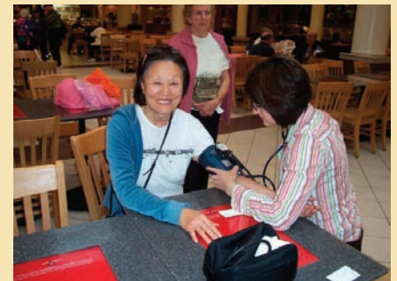
To help keep the older adult population strong and independent, Community Health & Wellness staff hits the road nearly 20 times a month for preventative health and blood pressure screening events.