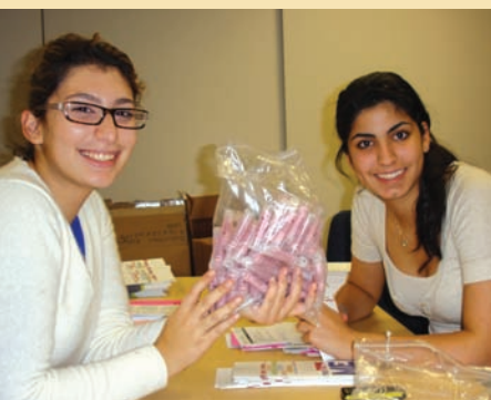
These students are earning community service hours by preparing packets that will increase awareness of the importance of early detection of breast cancer. The Check It Out program reaches thousands of 11th and 12th grade girls via a school-based educational assembly.

SOME OF OUR PARTNERS | American Trauma Society | Boy Scouts of America | Hadassah, Greater Washington Area Chapter | Maryland Hospital Association | Montgomery County Department of Parks and Recreation | Montgomery County Public Schools | Safe Kids Coalition | Safe Sitter International | YMCA Youth and Family Services | Scotland Community