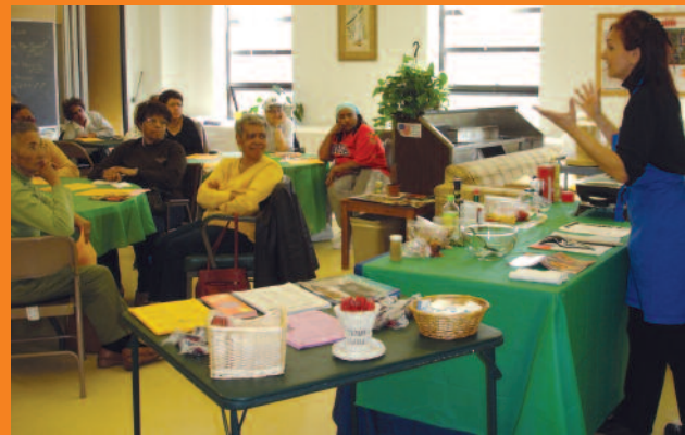
Southern Maryland residents learn the benefits of heart healthy cooking.

and grows. For nearly 65 years, Suburban Hospital has embraced this responsibility as the cornerstone of its mission. Recognizing that the health of the community is