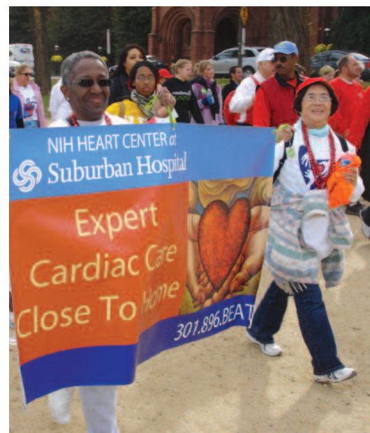
Suburban hospital employees, family, and friends raised more than $25,000 to support the American Heart Association's 2007 Heart Walk!

In total, the hospital conducted 2,196 health screenings, wellness activities, and community events in FY07, contributing more than $64,000 to help ensure the prevention and early detection of chronic diseases such as diabetes, hypertension, and hyperlipidemia. Of the 168,980 encounters at those events, more than half were minorities.