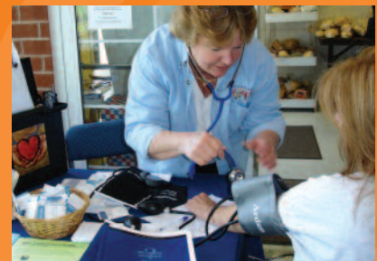
Members of the Health Ministry Team Network provide blood pressure screening and education as part of Suburban Hospital's collaborative community outreach effort in Southern Maryland.

wellness, and promotion services for area residents with a continued focus on underserved seniors, youth, minorities, and the uninsured.