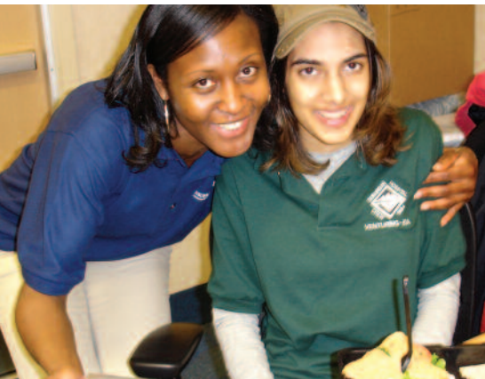
More than 60 Montgomery County high school students interested in exploring medical careers participate in Suburban's Medical Venturing program.

Montgomery County is home to one of the highest number of new immigrants than any county in the nation. As a result, the community has experienced dramatic growth in the proportion of residents belonging to racial and ethnic minority groups, many with limited