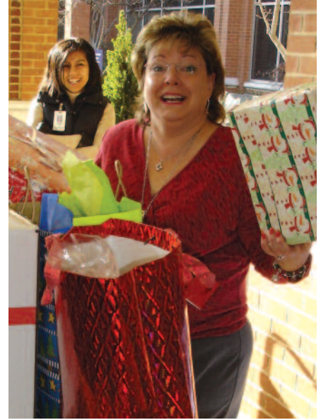
In partnership with Montgomery County Public Schools, Suburban Hospital adopts 30-35 needy families during the holidays, providing food, clothes, home supplies, and special gifts.

Operating at the community level, Suburban Hospital has affiliated with 33 health coalitions and associations; partnered with more than 30 elementary, middle, and high schools; and conducted wellness programs in collaboration with more than 15 corporate companies encompassing over 20 zip codes throughout Maryland and Washington, DC. Through these relationships, Suburban Hospital's Community Health and Wellness Department conducted nearly 2,350 community health activities in 2007, reaching more than 175,000 citizens.