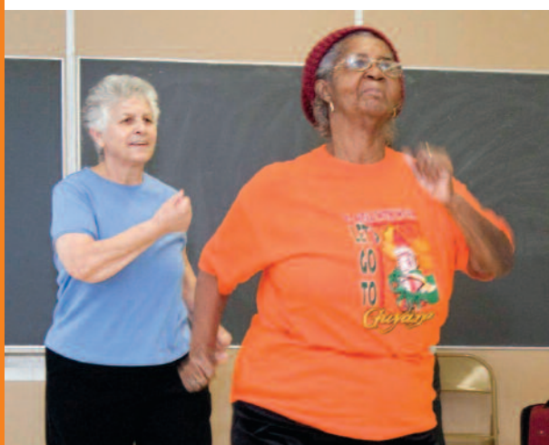
Seniors are keeping their hearts fit with one of the free Senior Shape exercise programs sponsored by Suburban Hospital.

In addition to encouraging active lifestyles, Suburban Hospital's Community Health and Wellness staff conduct blood pressure screenings at 10 local senior living and community centers each month. These screenings empower older adults to be more proactive in living independent, healthy lives. In 2007, Suburban Hospital held more than 80 community health seminars in various senior centers throughout Montgomery County. These programs were supported by more than $1 million in program operations in FY07.