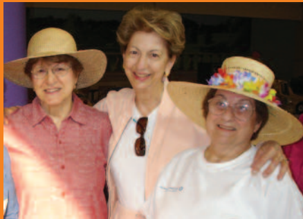
Area women benefit from the Stepping Out Mall Walking program.