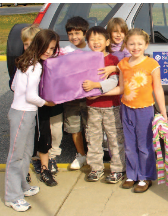
Seven Locks Elementary school students donate puzzles, games, and educational toys to Suburban Hospital's Pediatric Center.