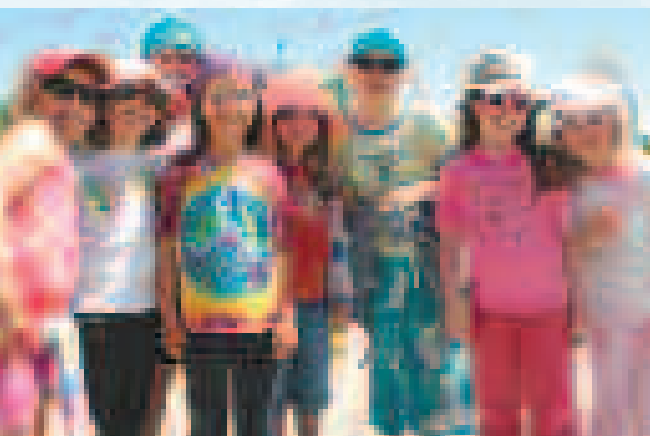
Travilah Elementary School students in North Potomac don hats and sunglasses at recess to protect them from the noon-day sun.

Suburban Hospital is able to reach beyond its walls to provide beneficial community outreach services effectively thanks in part to the commitment and generosity of several donors. Earnings from the J.B. and Maurice C. Shapiro Endowment for Women's Health and the Frederick H. Bowis Community Health Endowment funded health education and outreach activities focused on women's health and emergency preparedness, while the Clark-Winchcole Foundation supported efforts aimed at low-income and uninsured residents throughout Montgomery and Prince George's counties. Additionally, special recognition is extended to the Susan G. Komen Foundation for providing funding to conduct breast cancer screenings, and to the Sidney J. Malawer Foundation for dedicating resources to conduct vital skin cancer screenings at no-cost to the community.