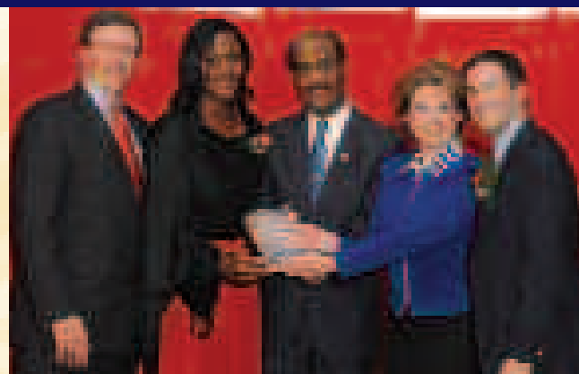
The Montgomery County Business Roundtable for Education (MCBRE) recently honored Suburban Hospital with the Business Champion for Children award for its long-standing relationship with Ashburton Elementary School. The award recognizes a local business that makes an extraordinary impact on the lives of county students.

Similar to the empowerment strategies for the community's young people, Suburban Hospital's community Outreach Department engages the senior population by encouraging active and healthy lifestyles. In FY06 Suburban Hospital