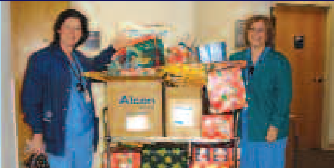
One of nearly 300 Senior Shape strengthening programs held during 2006.